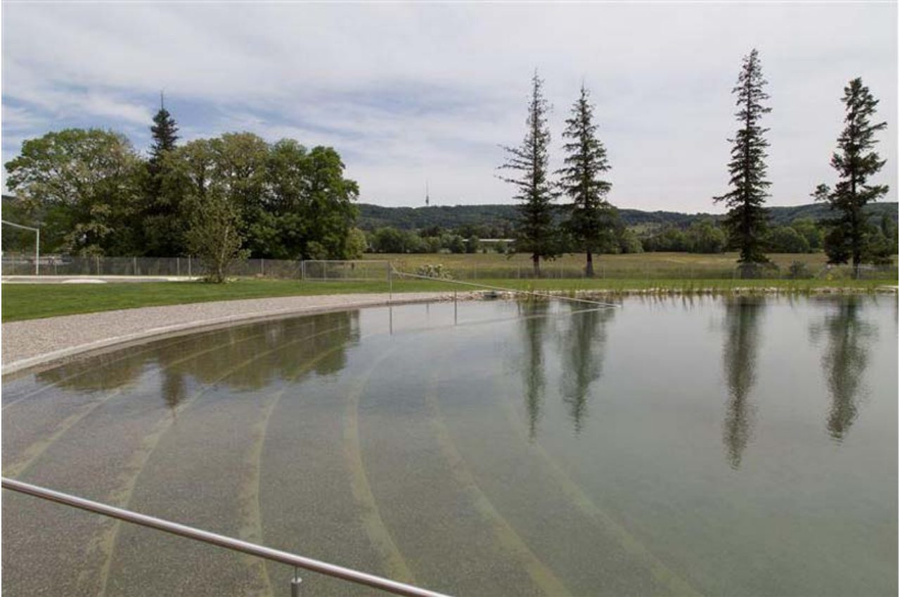
a gravel beach gently slopes to provide a slow entry into the bath