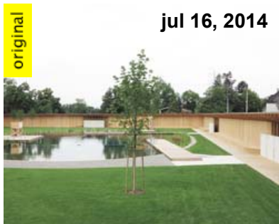
herzog & de meuron creates natural bathing pond for »