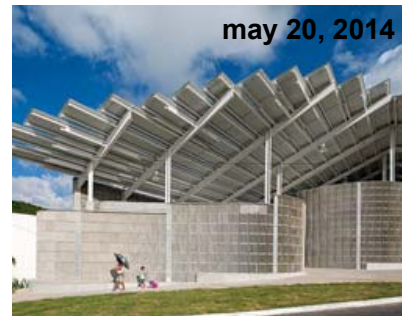
herzog & de meuron-designed arena do morro opens in brazil