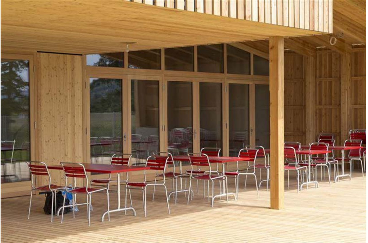
the facility includes a small café