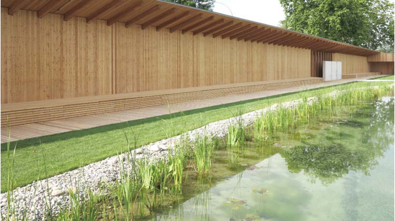
timber decks and walls wrap the central bathing pond naturbad riehen, natural swimming pool riehen, switzerland

in regards to both form and performance, the 'naturbad riehen' is treated as a natural pond rather than a standard swimming pool. its edge takes an irregular and vegetated boundary, with various methods for guests to enter the water. these include a gently sloping gravel beach, staircases, as well as wood docks which allow for a jump into the small lake.