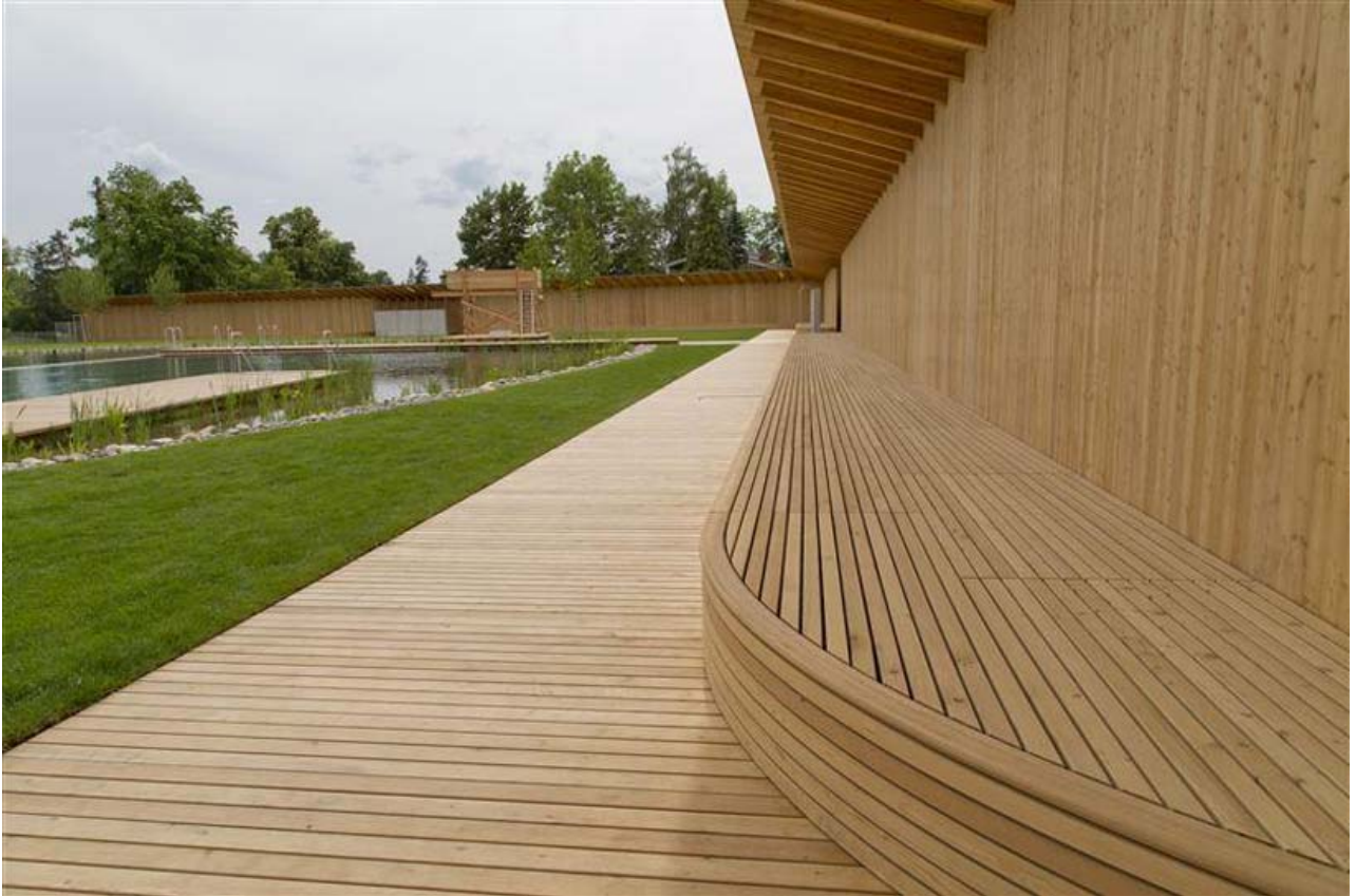
decks wrap the pond to provide areas for sunbathing