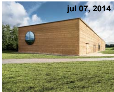
herzog & de meuron inaugurate ricola herb center in laufen