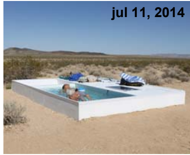
alfredo barsuglia sites social pool in remote area of the »