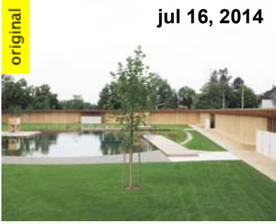
herzog & de meuron creates natural bathing pond for »