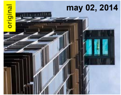
glass pool cantilevers from hong kong's hotel indigo by »