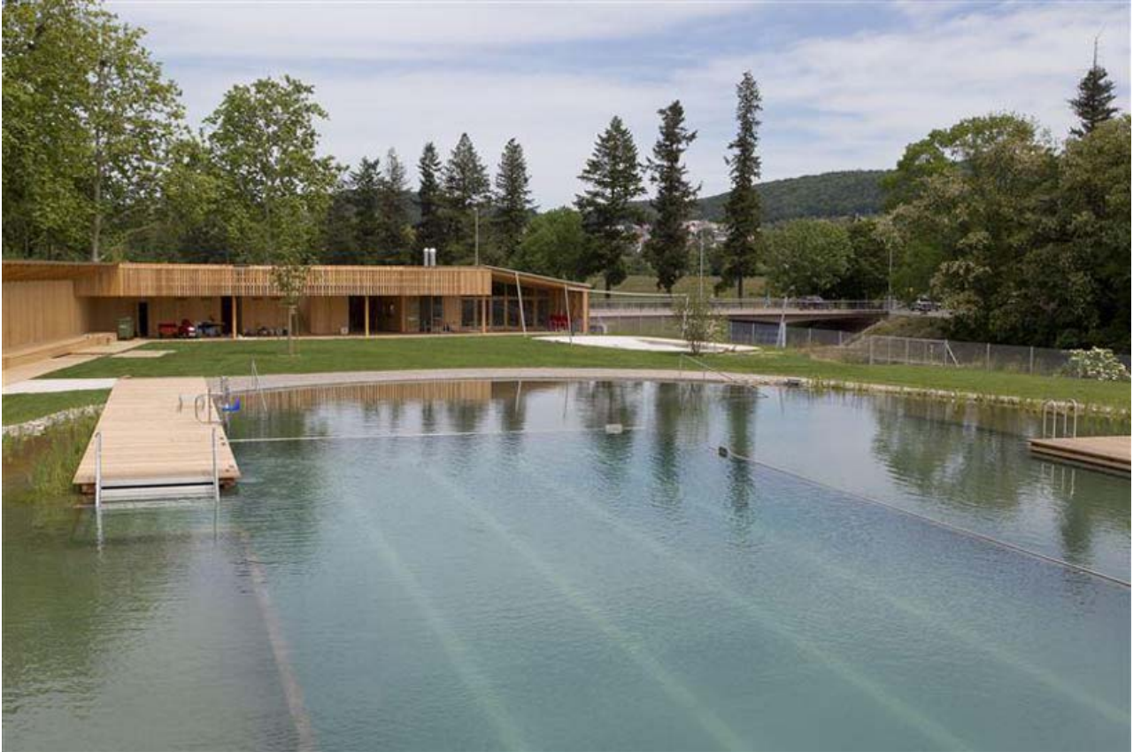
the south edge of the site is visually open to the adjacent river

the bath site is enclosed on three sides by timber walls, which also contain facility services. the north and east edges block out noise from roads, while the west border faces private residences. the property is open to the south, toward the river, bounded only by a vegetated hedge. the arrangement places all attention toward the pond at the center. long wooden decks line the complex, allowing for sunbathing and relaxation.